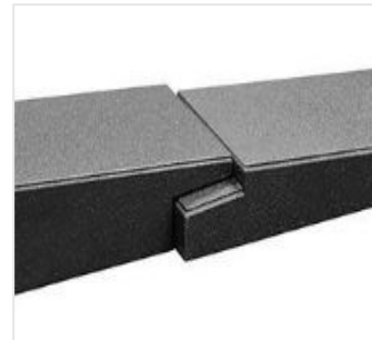
BT-TT-7-10-2 (2-pc model) Same dimensions as 1-pc model