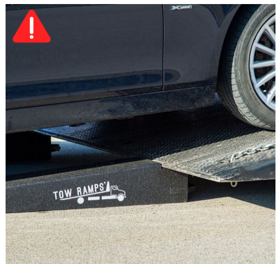
Fig. 2: Be careful to properly position the flatbed/trailer bed on the notch. DO NOT USE EXCESSIVE FORCE.