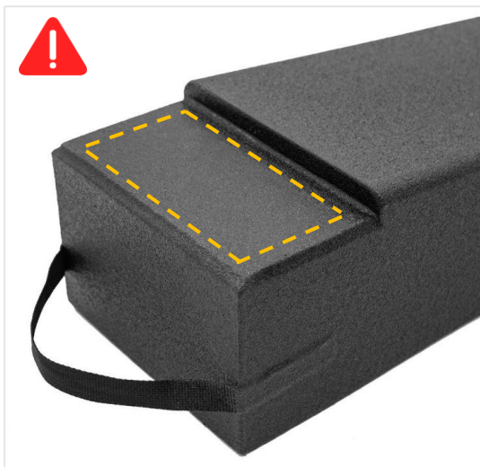
Fig. 1: Gently lower the flatbed/trailer bed and place on the Tow Ramp notch.